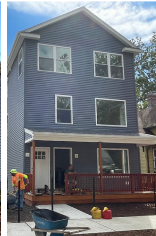
83-85 Butler Street