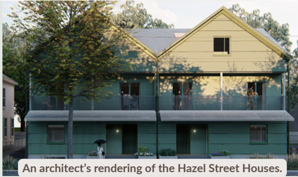
An architect's rendering of the Hazel Street Houses.