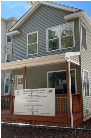
44 Lilac Street

Our biggest project of the year has been the new construction of four houses in the Newhallville neighborhood of New Haven: Three 2-family houses and one single-family house , encompassing seven total units of beautiful, sustainable, and truly affordable owner-occupied housing.