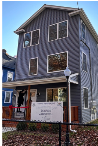
98-102 Bassett Street