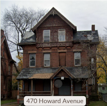
470 Howard Avenue

We will be completing the historic restoration of 470 Howard Avenue and begin the gut rehabilitation of 27 Frank Street. We will also be constructing four duplex townhouses on Hazel Street in Newhallville that will produce eight units of housing and bring four new first-time homebuyers into Newhallville; in addition, we will be constructing two new two-family houses similar to the ones that we have constructed in Newhallville this year, one of which will be in the Hill neighborhood and the other will be in Newhallville.