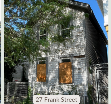
27 Frank Street