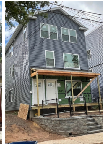
260 West Hazel Street